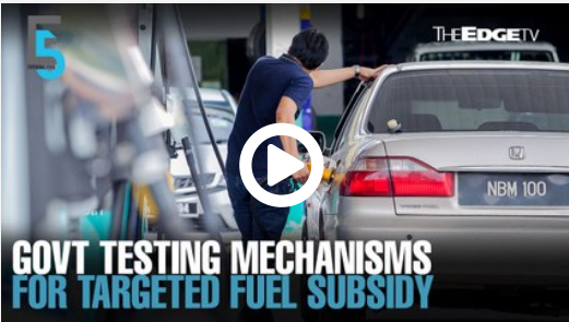
07 Jul 2022 | 09:23pm Featured, Eveni... EVENING 5: Govt testing mechanisms for targeted fuel subsidy