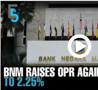
06 Jul 2022 | 09:27pm Ev... EVENING 5: BNM raise to 2.25%