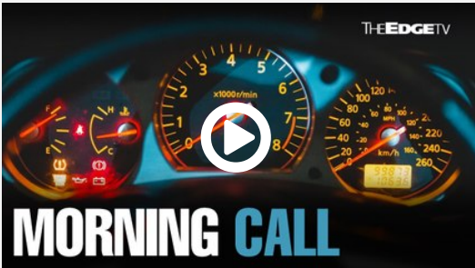
07 Jul 2022 | 06:25am Morning Call, F... MORNING CALL: 6/7/22